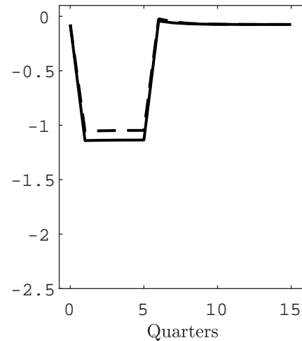
Expected inflation, E_t\pi_{t+1}